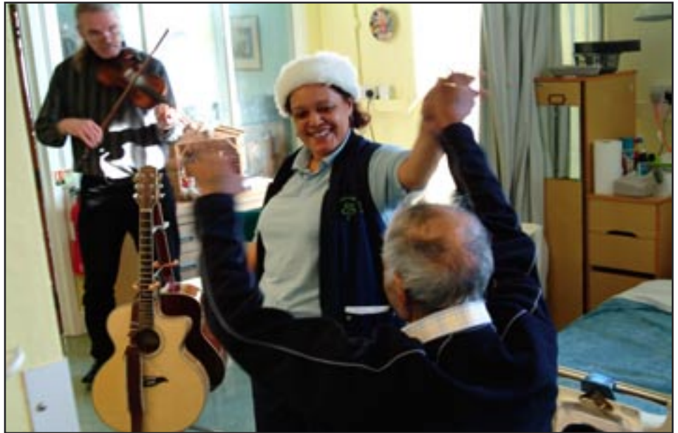
“Shall we dance?” Irish jigs are popular with patients and staff alike.